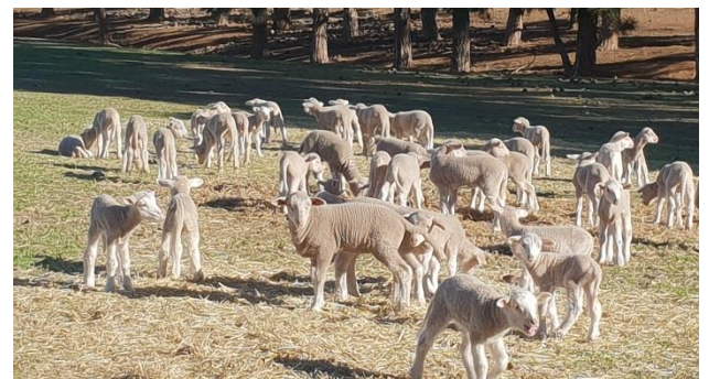
Fertile Glen Holme ewes (L) due to lamb in April/May 2019 having raised lambs in spring 2018. (R) Lambs born in April /May 2019

The return to fertility of Glen Holme ewes is high. This was not the first time we have had a high success rate using this model. It is a valuable strategy to help rebuild the nation's ewe base post drought, or to build a self-replacing commercial ewe flock with surplus numbers able to be offered to the marketplace.